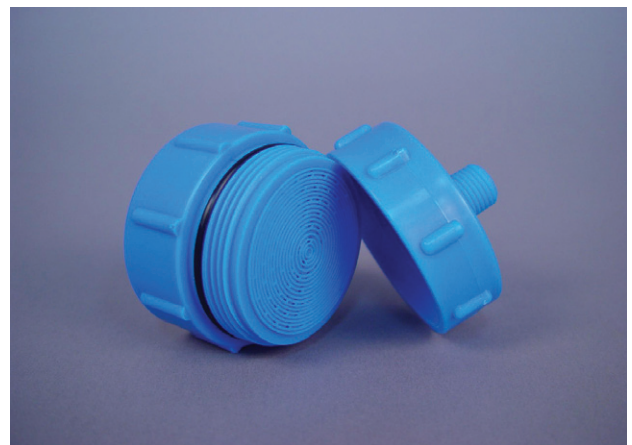
Part Number: CHP-47