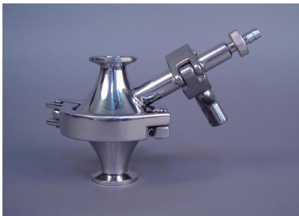
Part Number: CSH-47

CHP 47 mm Polypropylene Disc Holders are designed to give you an economical alternative when sampling and evaluating media. It comes standard with EP O-ring and 1/4-inch MNPT inlet and outlet connections. Assembly is easy. Simply insert the 47 mm disc and thread the two body halves together.