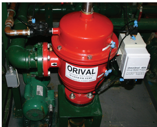
Figure 1. ORG Cut-A-Way.

The ORG filters use line pressure to power the self-cleaning mechanism for higher efficiency and lower capital cost.