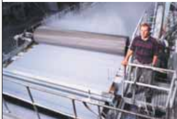
Energy efficiency has resulted in reduced CO 2 emissions (650 tons per year)