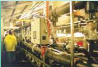
Pre snow gun water polishing at skir esort in Australia. Water supply from local storage dam.