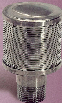
Economy Male / Female Nozzle