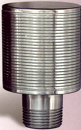
Standard Male / Female Nozzle